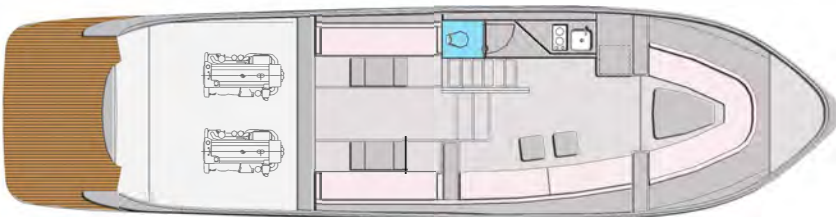
LOWER DECK OPTION 2